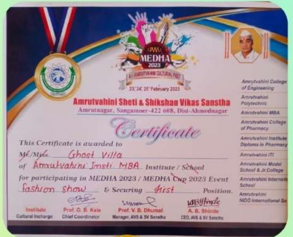
Fashion Show First Prize 🏆